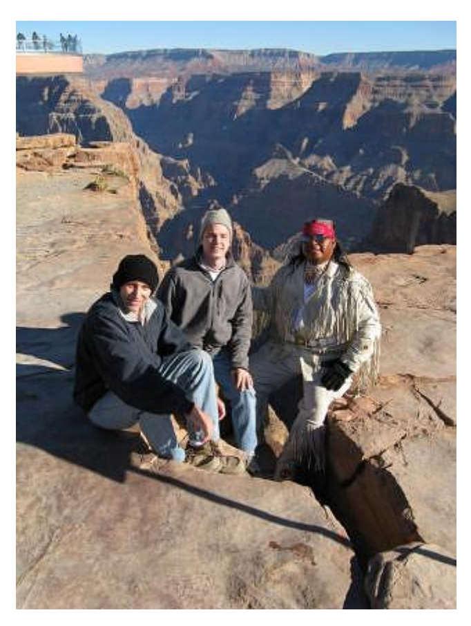
Ray and I with one of the Hualapai Indians at the Grand Canyon Skywalk

After a busy trip back home for the holidays, I was looking forward to spending a few days in the desert during the 4 day weekend over New Year's. Road tripping through the desert has always been a great way to see interesting parts of the country, as well as providing time to cleanse my mind. Seeing nature in its raw form and unspoiled landscapes gives an appreciation beyond our everyday climate-controlled world, where God's presence suddenly becomes more real.