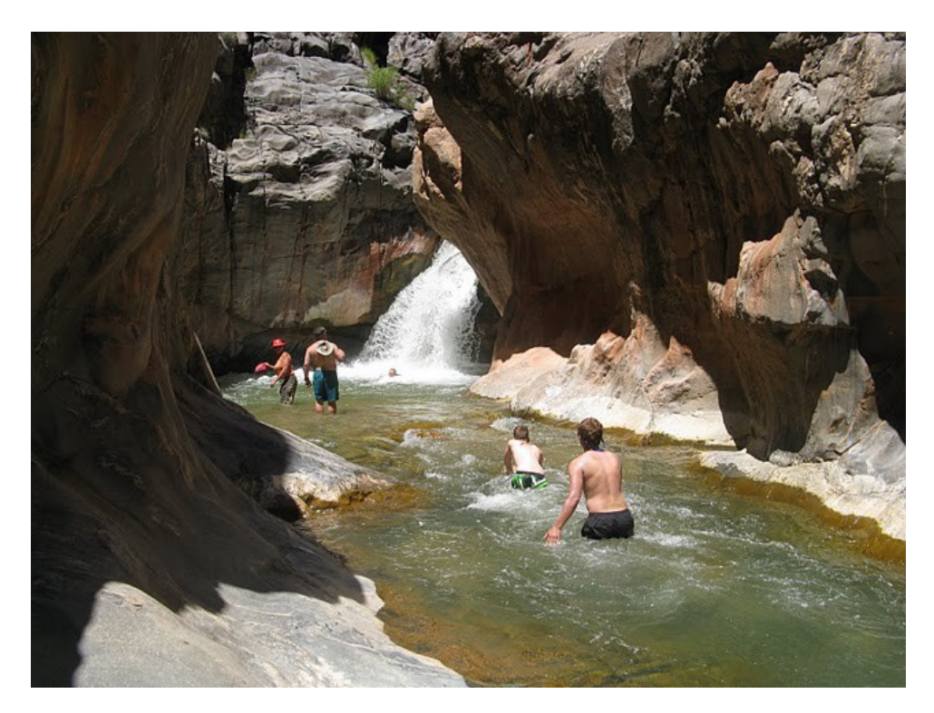
Shinumo canyon and falls

I inspected the waterproof bag the camera was in, and I saw that it had developed a small tear near the seal. I had paid around $20 for the bag - probably should have gotten a better one. I couldn't find the bag I used 2 years ago - oh well. At least it was my old camera (which had several other issues anyway, like hairs and dirt stuck on the sensor and a lens that you had to fiddle with occasionally to close). I had my new camera (which was in my "checked luggage" for the day in my dry bag), so it would have to wait until we got to camp. I'd try to be more careful with my new camera for the rest of the trip since that's would I would be relying on. But I only had 1 spare battery (the newer camera took an expensive lithium battery).