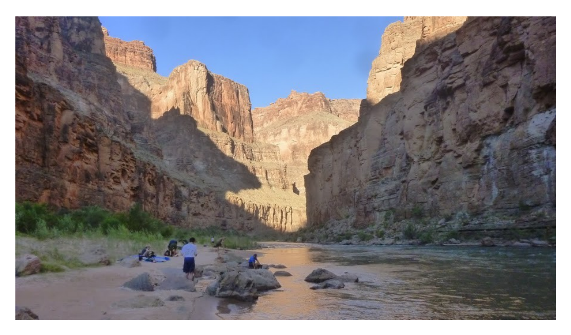
Morning at camp at National beach

The next morning, we knew we had our biggest challenge of the trip - Lava Falls! It was the only rapid that would be rated a 10 on the Colorado (probably a class IV+ to V). I'm not sure why the Grand Canyon uses a different scale - perhaps it's because there is so much water that even though the rapids are big, most boats can pick a line and people would hunker down and just power their way through. On many rivers, like the Tuolumne in CA, the rapids are far more technical, requiring finesse to navigate the lines between boulders and holes.