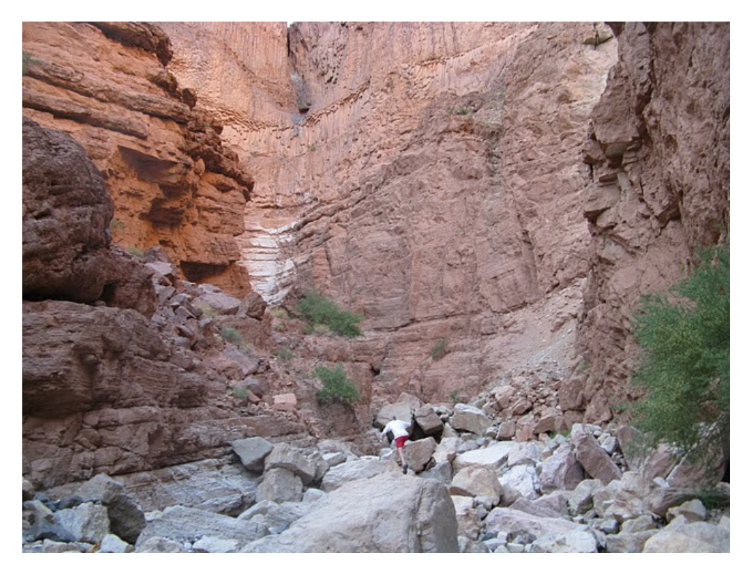
Hiking up Whitmore canyon

a deep emerald pool, tucked deep in the rocks. It was a secret and hidden spot I don't imagine many people would get to.