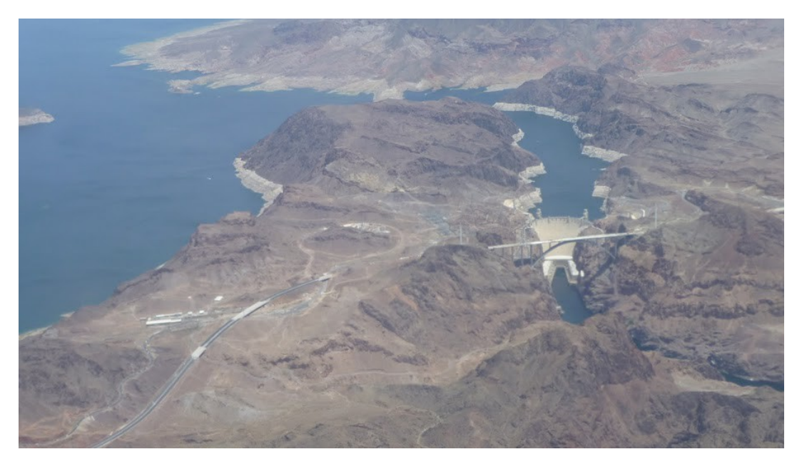
Lake Mead and Hoover Dam

nature" had to be put forth to allow a straight freeway to navigate the curving slopes of the canyons.