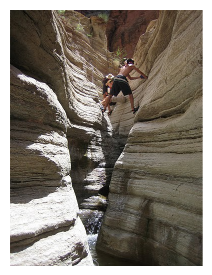
Muav narrows in Matkatamiba canyon

The canyon had seemed to appear suddenly when we were rafting - there wasn't anything like it nearby. I'm glad our guides really know the canyon well and where to take us! And they showed us how to navigate and climb our way up so we could all enjoy it - I think the guides sensed we were a pretty responsible group and could handle the challenge of Matkatamiba canyon - very cool.