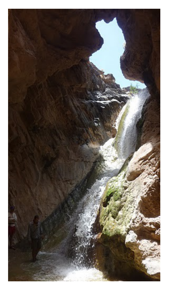
Travertine grotto falls

But I forgot about all the troubles with my contact once we got to Travertine canyon. I pulled my newer camera with the hope that it would be having a good day, and when I turned it on, the lens opened just fine - was good as new - whew! The canyon was spectacular, with a creek running through, leaving a beautiful emerald green set of deposits, cementing all the gravel and rocks in place. The Hualapai Indians had installed a set of ropes and ladders allowing us to climb a series of waterfalls and navigate the steep rocks to get to the grottos inside the canyon - wonderful!