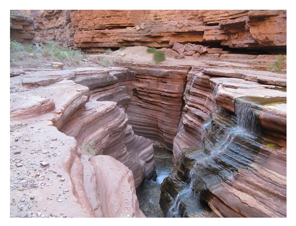
Slot canyon in Tapeatz ledges above Deer Creek falls

It was a long day and it was getting late (we spent a bit longer at Deer Creek than planned, but I wasn't complaining!) - We found a site just downstream to camp at Poncho's Kitchen. Here the Tapeatz layers reached all the way to the river and provided some nice ledges to camp on. A giant cave (sort of like Redwall Cavern) was just behind our camp. Some people ended up sleeping in the sloping sand inside the cavern but most people found some nice ledges right by the river to camp.