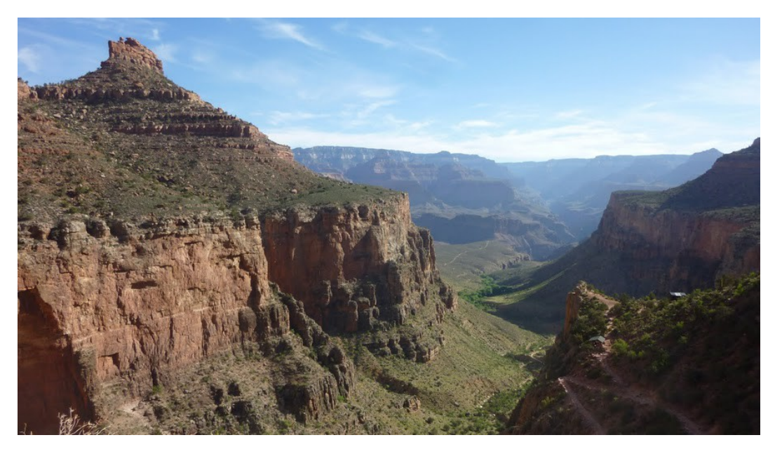
Hiking the Bright Angel trail toward Indian Gardens

It was getting hot already - I'm really glad we didn't have to be hiking back up in the heat! I found a couple old abandoned mining tunnels that I used to cool off (it was probably 30 degrees cooler inside!) - and it was an excuse to break up the hike a bit and explore... We followed a mule train for a while down the canyon - I wondered if I was going to pick up a lucky horseshoe again (in Yosemite the previous year on a backpacking trip, we moved aside to let a train pass, and shortly after they passed, I got to pick up a shiny new horseshoe one of the animals had just dropped) - but no such luck here - oh well.