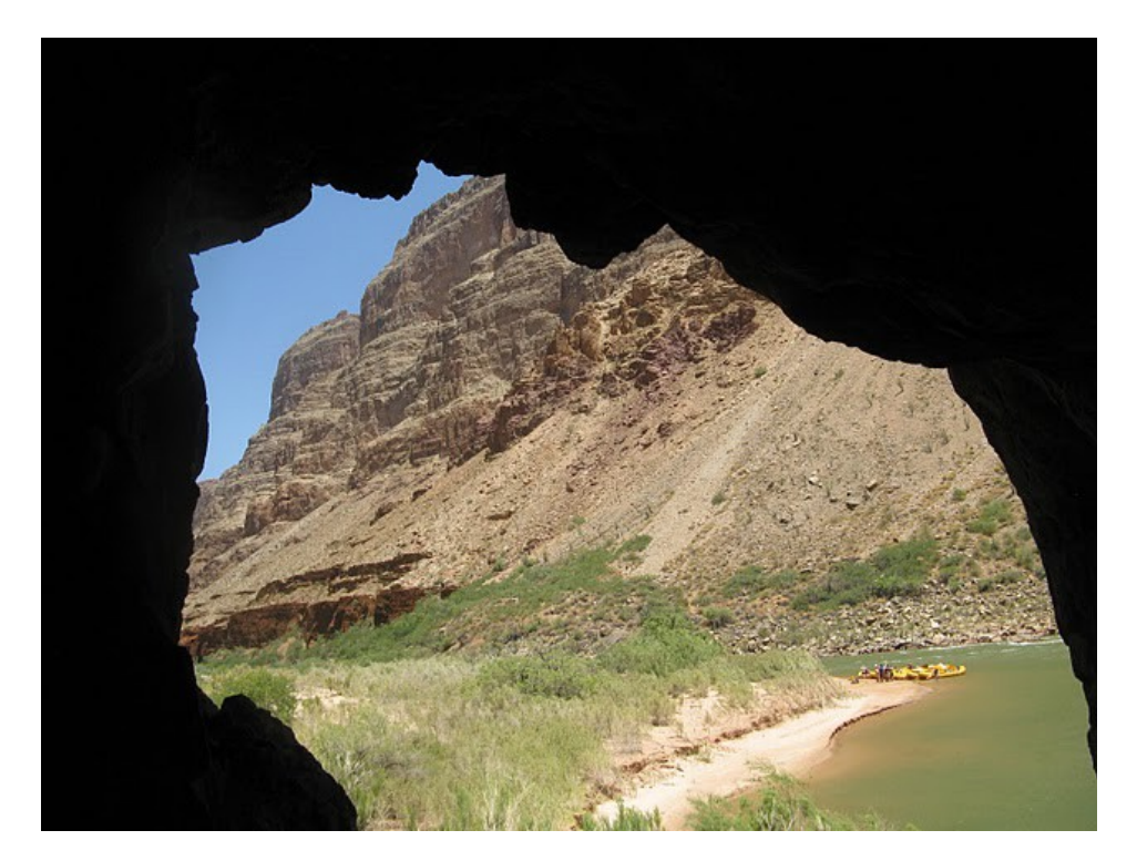
Lunch spot from lava cave

We had a few hours of pretty leisurely paddling until mile 202 where we enjoyed lunch along one of the beaches. The wind had kicked up - gusts blowing upstream and rippling the water and even causing some whitecaps. I remembered some wild wind on our previous trip - it looked like one of our guides was going to get sucked up in a small tornado at one point! We challenged each other to try the Frisbee - you'd throw it 10 feet forward and it would fly 50 feet backward if you didn't throw it right! Luckily we had a nice spot tucked in the tamarisk and mesquite bushes sheltered from the wind for our burrito wraps for lunch. Some small lava caves and a nice side canyon were nearby. I was always curious to see what was around each of our spots since the Grand Canyon hides many mysteries, so I went out for a bit of exploration. The side canyon quickly narrowed to a slot where a 15-foot boulder choke blocked the entrance - quite scenic but would have been hard to go further without a rope - oh well. The caves were interesting - probably caused by large air pockets in the lava as it cooled. One of the entrances gave a perfect picture, framing our lunch spot and rafts parked on the sandy shore.