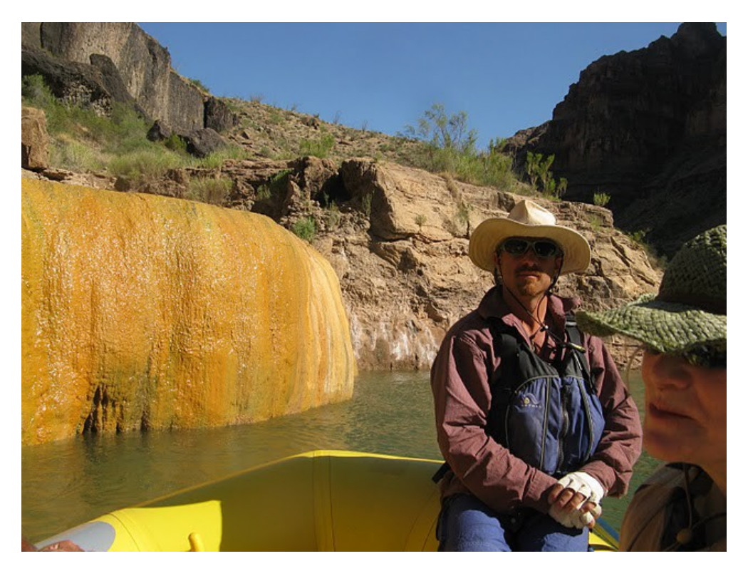
Reaching our camp at Pumpkin spring