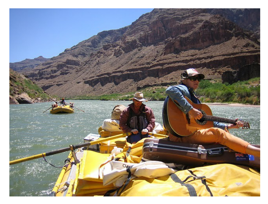
Enjoying some good music on the river

the wind). And as an added blessing, she was playing the guitar as Phil was rowing - life was good even when things may have seemed rough around us!