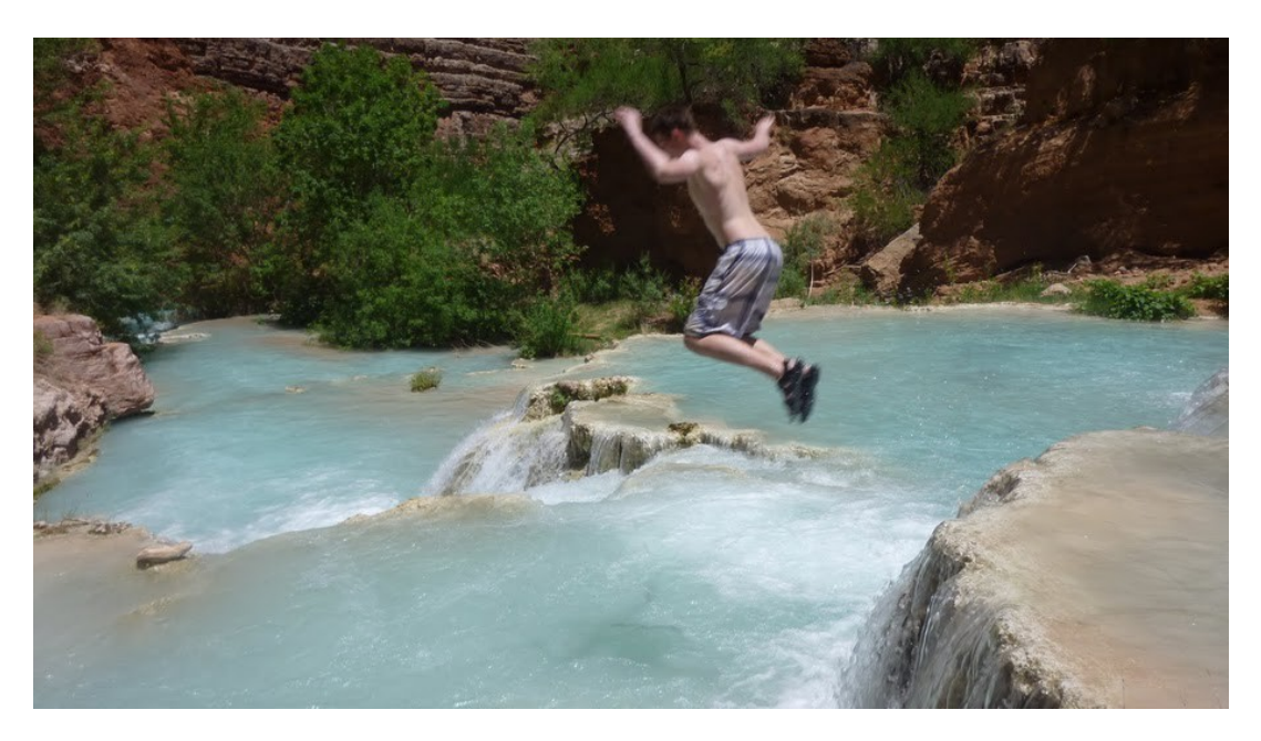
Jumping from Beaver falls

I was glad to have the sack lunch and spend a couple hours at the falls - there was so much to explore and places to relax and enjoy the cool blue water under the hot sun. I recalled the paradise from 4 years ago and I loved being able to re-live it all. I wished we had a layover day at Havasu creek so we could spend all day and go up further to Mooney and Havasu as well, but we'd have to come back on a future trip. We chatted with some backpackers who had come down from the rim, and I remembered 4 years ago meeting people who hiked up from the river - I now have 2 completely different but wonderful experiences around Beaver falls.