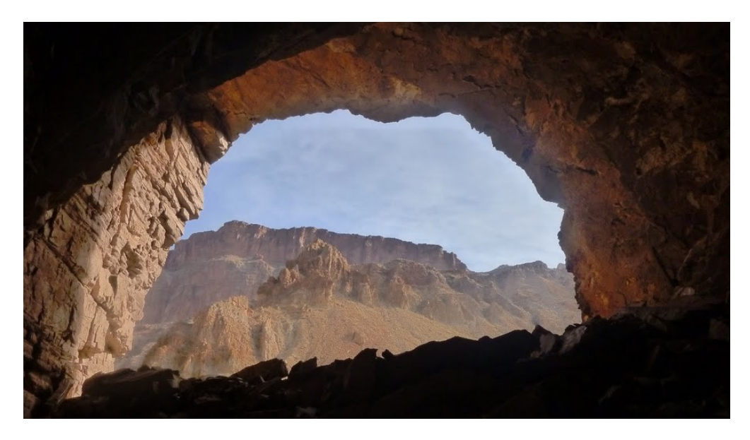
Enormous cavern above our camp

flashes to light up the back of the cave (I knew my battery was limited so I tried not to use too many flashes though). Sitting in the stillness and cool by the entrance of the cavern (it was 20-30 degrees cooler than outside), I pulled my devotional and meditated for a minute. I was reminded of how Jesus had to go to a quiet place occasionally to meditate and pray by himself. I've found it easy to experience spiritual dryness on vacations, being away from my routine and getting so wrapped up in emotions and my immediate surroundings that I can easily lose the spiritual perspective. Having a few minutes to reflect on God's grace and goodness definitely rejuvenated my spirit.