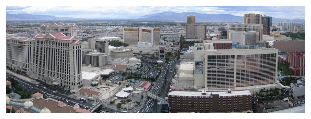
Panoramic view from the Eiffel tower

In the evening we enjoyed the Beatles Love show at the Mirage (something I've wanted to see for years now) - the acrobatics were excellent and the music was classic! The sound system has thousands of speakers - in fact one on every seat - talk about surround sound! The $90 tickets were expensive, but worth every penny. And there wasn't anything racy or overtly sinful the show was good for families, so it was a good way to enjoy Vegas.