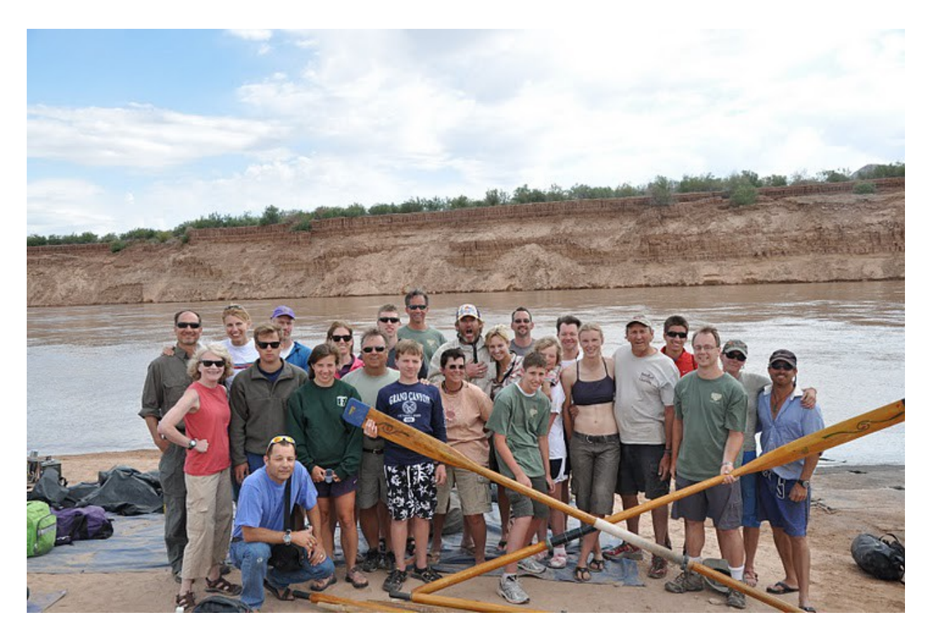
Our whole group

Our luxury coach had just pulled in - our ride back to Las Vegas. I sort of got a bit teary eyed knowing our 9 days was over and we were heading back to the garish lights and crowds of Vegas. And the sky seemed to get teary-eyed too. An early season weather system started moving in and we got a bit of rain while on the bus through the Mohave Desert on our way back to Vegas (the guides say June is the driest month, so the rain was quite unusual). We left just in time - all our days were sunny and warm (a couple clouds right near the end, but nothing too substantial), but it was changing (they predicted scattered thunderstorms and cooler temperatures for a couple days right as we left).