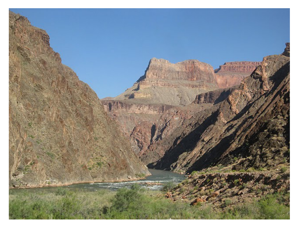
Crystal Rapid just downstream from our camp

We formed the baggage line and soon we had everything packed on the boats and we were ready to hit the water. I was a bit nervous about the rapid - it might be a long and rocky swim if we were knocked out! And we didn't want to lose any other supplies! All our gear, sleeping bags, kitchen supplies, and food had to go through all the rapids (no shuttle bus to pick us up and take us to camp each day!) We all made it through just fine – thanks to some excellent guiding through the river.