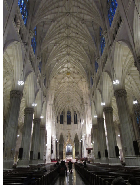
St. Patrick's Cathedral

I probably spent an hour inside, wandering the various hallways and side altars, admiring the work and care taken as an act of worship. I hope it can last another 750 years! Walking across the street, I came to Saks Fifth Avenue, which in stark contrast seemed to be a sanctuary to consumerism and money. Wandering just one hallway inside was enough - I sampled one spray of designer cologne, which was probably easily $100 for a small bottle. (The scent remained for nearly a week, which was surprising, so maybe it would have been worth it!)