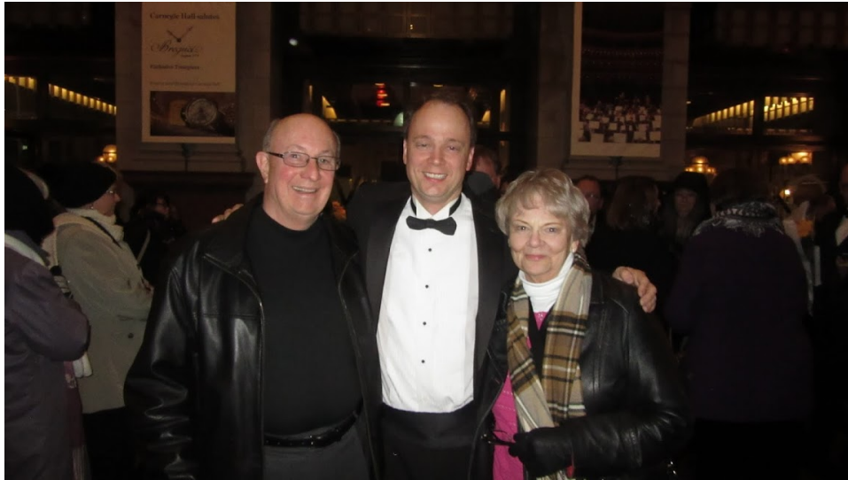
Meeting my parents