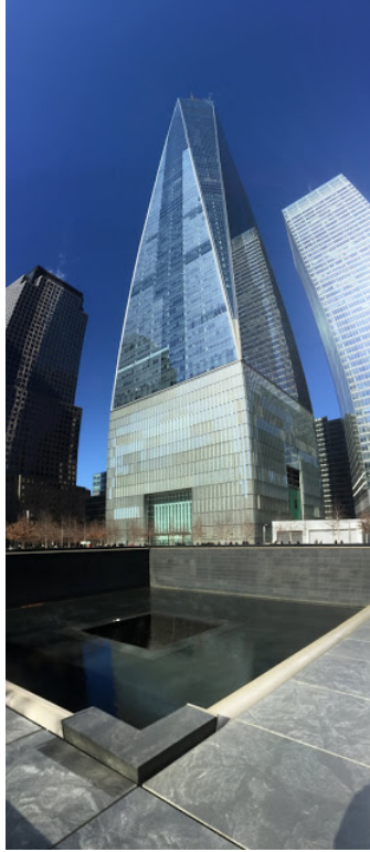
Freedom Tower and remembrance pool

People were lined up for the elevators, patiently waiting their turn. We were told at the counter the next available ride wouldn't be until around 5:30, after sunset, a 1 1/2 hr wait. I was hoping to see the sunset from the top, but knowing our tickets for the show afterward were for a 7:30 show, that would make things rather tight. We might end up having to scarf a quick dinner on the go in that case. We were told, however, for $20 more, we could get the "VIP upgrade", putting us to the front of the line and giving us access to the "VIP lounge" where we could enjoy drinks with the view. Sure - we thought, we had splurged a bit on this trip to NY, what was $20 more?