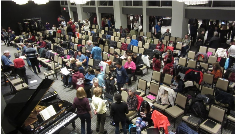
Taking our seats for rehearsal