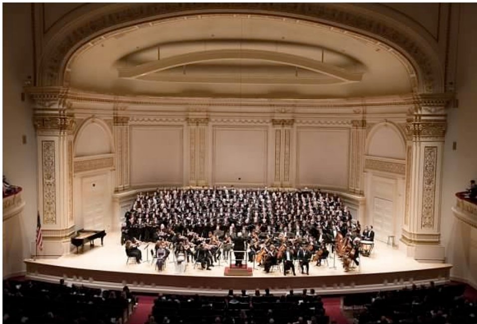
On stage at Carnegie Hall

The soloists sounded wonderful. The bass in “Tuba Mirum” rang a deep tone as if the earth itself was singing. The soprano in “Lux aeterna” sounded like heaven singing. The final “Sum Sanctus” double fugue urgently sprang forth as the entrances accelerated in stretto fashion. The diminished 7th chord right before a pregnant pause on the very last line of the work set the entire orchestra and chorus for the finale “Quia pius es”. I felt a sonority so grand, as if the gates of heaven were ringing with the open 5th of the final D chord.