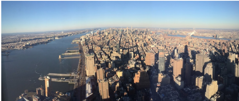
Manhattan from the Freedom Tower

With our VIP passes, we were escorted away from the crowd into a private VIP lounge. The modern decor was swanky and sophisticated. A bar in the corner beckoned us for drinks. Given our VIP passes, I felt - what the heck? Live like a high roller for an hour or two! The "NYC Yellow Cab" mixed drink felt as overpriced as the medallions on the taxis. The vodka and juice drink was satisfying but cost a pretty penny - $22. But it was all about the experience. It was definitely an afternoon of mood whiplash - intense sorrow of the 9/11 museum, but intense joy of seeing the newly constructed tower, and getting to call Nisha to wish her Happy Valentine's day from the 102nd floor!